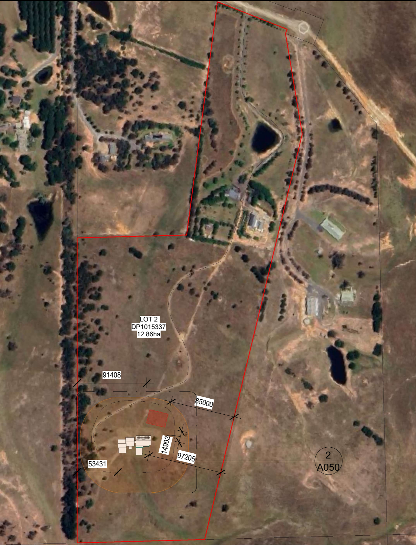
1 SITE PLAN - LARGE SCALE 1 : 3000